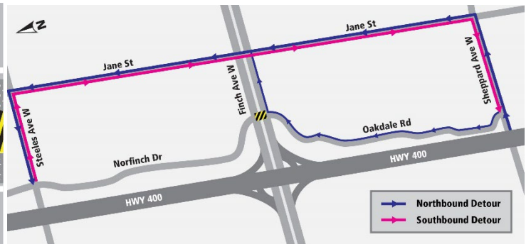
Map 3: Detour northbound and southbound. During one (1) day operation on June 8, 2024, approximately.